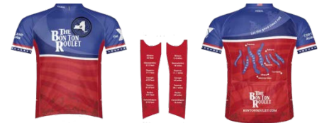
New Jersey Design by Primal Wear