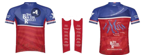
New Jersey Design by Primal Wear