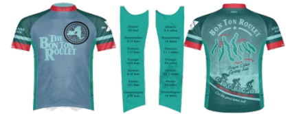
New! Jersey by Primal Wear